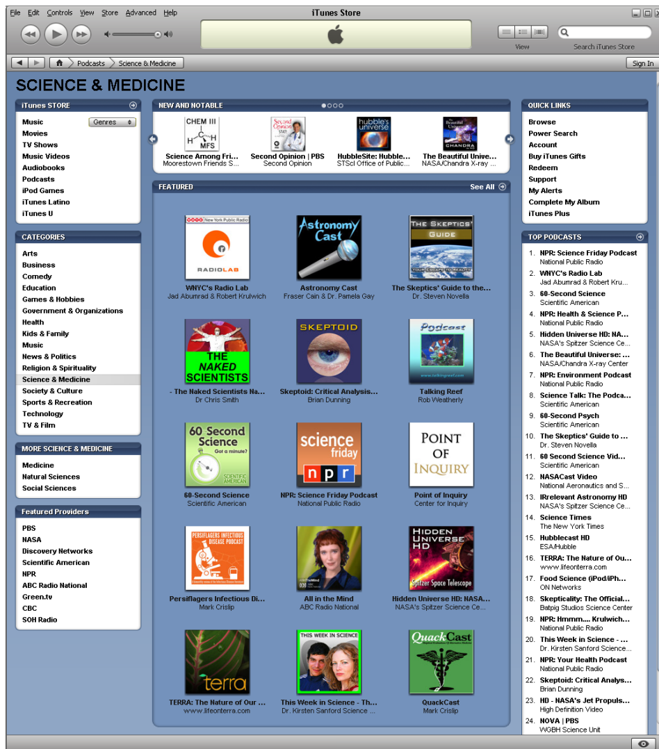
A template: The above iTunes interface should serve as a guide in designing the AstroFeeds interface

Podcasts and Vodcasts come in many forms ranging from straight audio to enhanced podcasts to vodcasts suitable for iPhone or HD TV. In some cases, one show will be available in all of the above formats! To try and share all of these formats at once, the AstroCasts will include all formats listed above sorted by keywords and popularity. Once in the AstroCasts section of the websites, users will be able to decide to display all formats or only a particular format. This versatility will allow users of video iPods to get a good combination of content, while