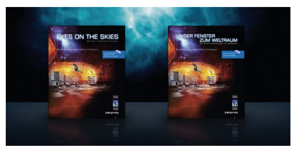
English and German covers of Eyes on the Skies

Building on the success of the Hubble-15 Years of Discovery (www.spacetelescope.org/projects/anniversary/), the IYA2009 Secretariat has decided to celebrate the 400th anniversary of the telescope with the production of a book and a movie, called Eyes on the Skies. We would like to invite you and all the IYA2009 partners to collaborate with us in this unique celebration.